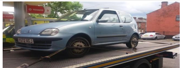
Vehicle seized Hollins Road, Hollinwood. Driver aged 15 years reported for no driving licence and no insurance. Car sent to the crusher.