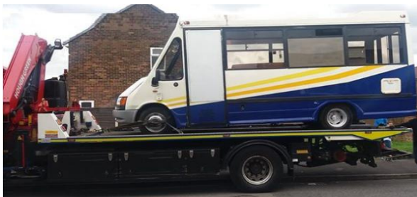
Vehicle removed from Laburnum Road, Limeside for having no tax or insurance