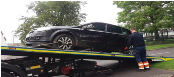
Stolen vehicle recovered and 3 male juveniles arrested on suspicion of theft of motor vehicle after making off from police on Lower Lime Road.