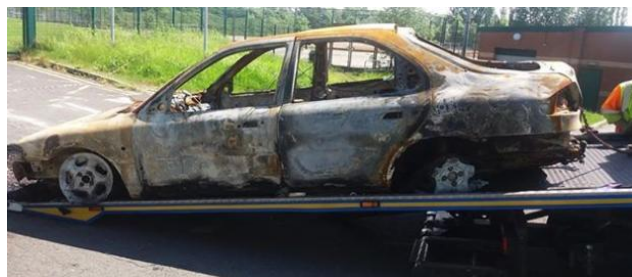
A burnt out vehicle removed from outside the Ball Hall near to New Bridge School. The vehicle yet to be identified - possibly a ford Mondeo .